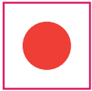
Made in Japan